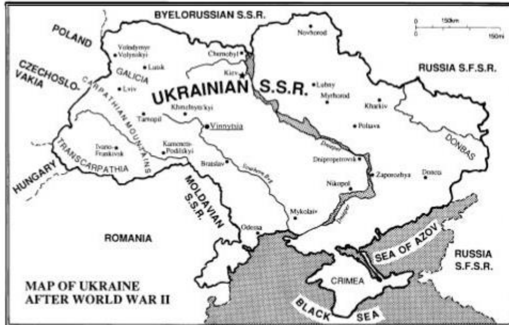
Map of Ukraine after World War II, indicating the location of Vinnytsia